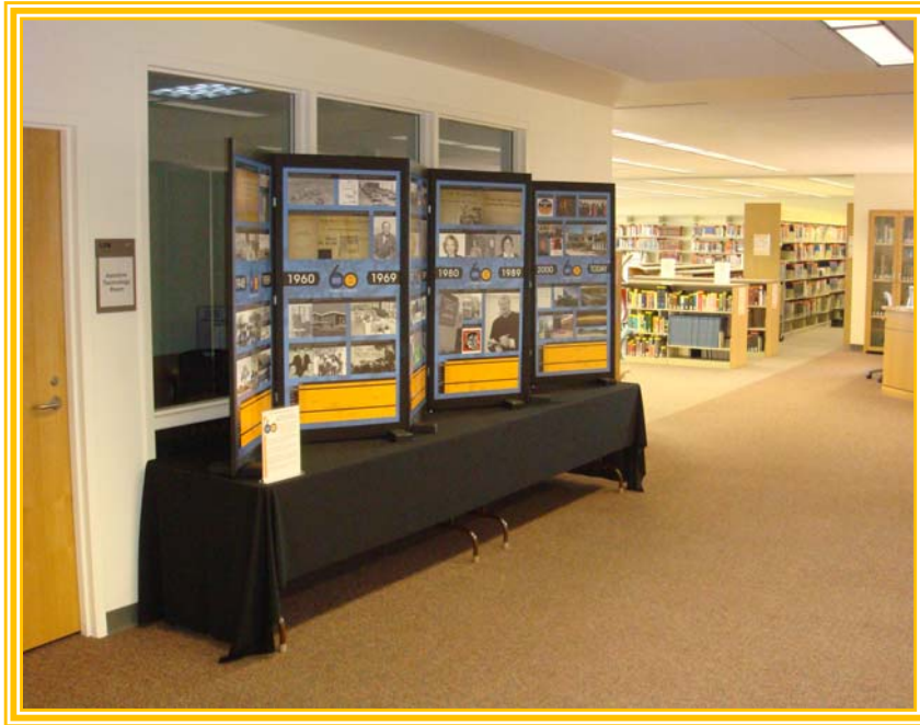
The 60 th anniversary history boards now on display at the DVC Library.

The 60 th anniversary history boards are now on display at the DVC Library and Antioch public library through the month of February. A complete calendar of locations for the next six months is available on the District website at http://www.4cd.edu/60th/cal.html